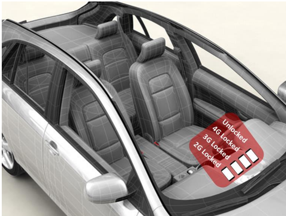
Figure 2 – Example of Inside view of the measurement car with antennae positions